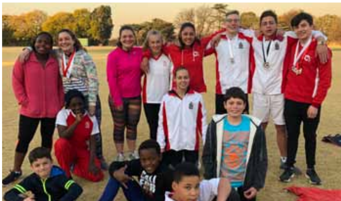
Members of our swim team that took part in the CGA Short Course Champs