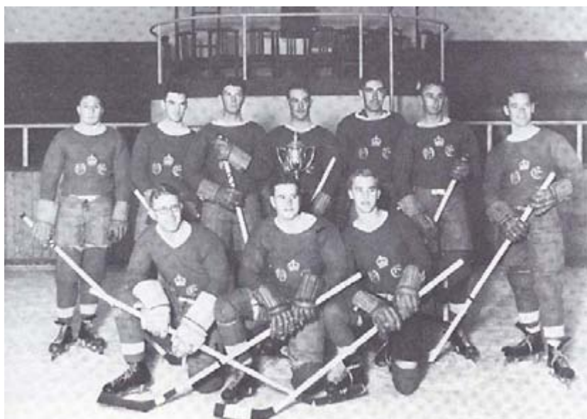
Old Edwardian Ice Hockey team – league winners.