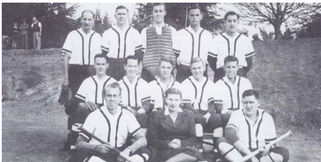
The Old Edwardian First Baseball team late 1940's .

Although the game was in its infancy, we joined Wanderers and Old Maristonians by entering a league team in that winter. It is possible that that was the first year of league baseball in Johannesburg. Pre war the game flourished and continued to do so after hostilities ended in 1945. It was in the early 1970's that interest waned and the sub club ceased to function.